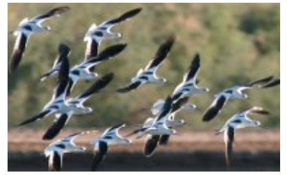
American Avocets wheeling