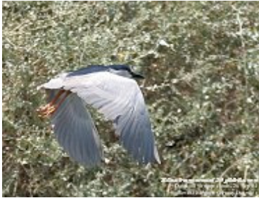
Black-crowned Night Heron