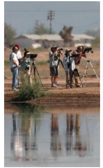
Looking for the Ruff 24 Sep 2004

Herring Gull Sabine's Gull Caspian Tern Common Tern Forster's Tern Least Tern Black Tern Rock Pigeon White-winged Dove Mourning Dove Greater Roadrunner Lesser Nighthawk Vaux's Swift Black Phoebe Say's Phoebe Ash-throated Flycatcher Western Kingbird Loggerhead Shrike Warbling Vireo Common Raven Horned Lark Purple Martin Tree Swallow Northern Rough-winged Swallow Barn Swallow Cliff Swallow Barn Swallow Verdin Rock Wren Ruby-crowned Kinglet Mountain Bluebird Northern Mockingbird Curve-billed Thrasher American Pipit Macgillivray's Warbler Orange-crowned Warbler Yellow-rumped Warbler Common Yellowthroat Yellow Warbler Western Tanager Green-tailed Towhee Abert's Towhee Savannah Sparrow Grasshopper Sparrow Song Sparrow White-crowned Sparrow Dark-eyed Junco Blue Grosbeak Red-winged Blackbird Western Meadowlark Yellow-headed Blackbird Brewer's Blackbird