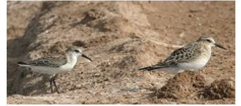
Western and Baird's Sandpipers

If you come in mid to late summer, keep in mind that you're in the heart of the desert, where afternoon temps often exceed 110 degrees Fahrenheit. Fortunately, water, food, and gas are available at Dateland, immediately south of the I-8 exit. And in the date palm grove immediately south of Dateland, you may find a Barn Owl and an assortment of flycatchers, warblers, and sparrows at the appropriate times of year.