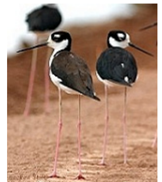
Black-necked Stilts (adults above & baby below) A most numerous shorebird!

- On the south side of Exit 67 is a gas station and the Dateland Store, home to date & cactus shakes, burgers, souvenirs, and rest rooms.