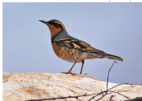
Varied Thrush – November 2009, near Hwy. 89A west of House Rock Valley overlook, Coconino, Photo/Shawn Putz.