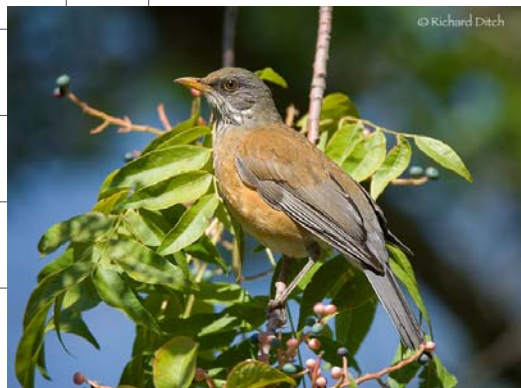
Rufous-backed Robin – October 2009, Boyce Thompson Arboretum, Pinal Co.

all 2009 and winter 2010 brought nearly unprecedented numbers of Rufous-backed Robins and Varied Thrushes to Arizona, providing excitement and many photo opportunities. Coming from different directions in North America to arrive in Arizona, they brightened many a field outing. Lawrence's Goldfinches also appeared in above normal numbers from our neighbors from the West. It was also an exceptional season for Ruddy Ground-Doves arriving from Mexico.