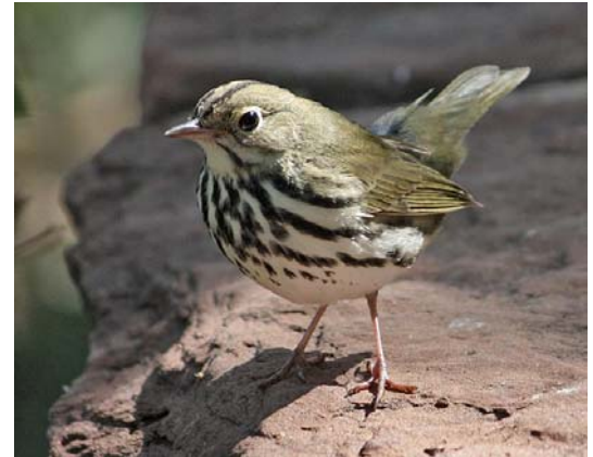
Ovenbird - September 2009, Cameron, Coconino Co.

http://www.azfo.org/gallery/1main/photos_recent.html