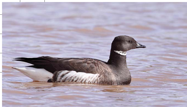
Brant —January 2010, Tucson, Pima Co.

With fewer than a dozen records for Arizona, it has also been an exceptional season for several aquatic birds beginning with two Black Scoters at Upper Lake Mary (Coconino Co.), Red-throated Loon near Litchfield Park (Maricopa Co.), and two Red-necked Grebes with one in Glen Canyon (Coconino Co.) and the other on Lake Pleasant (Yavapai Co.). The latest in this category was a one day visit by a Brant to an urban pond in Tucson (Pima Co.).