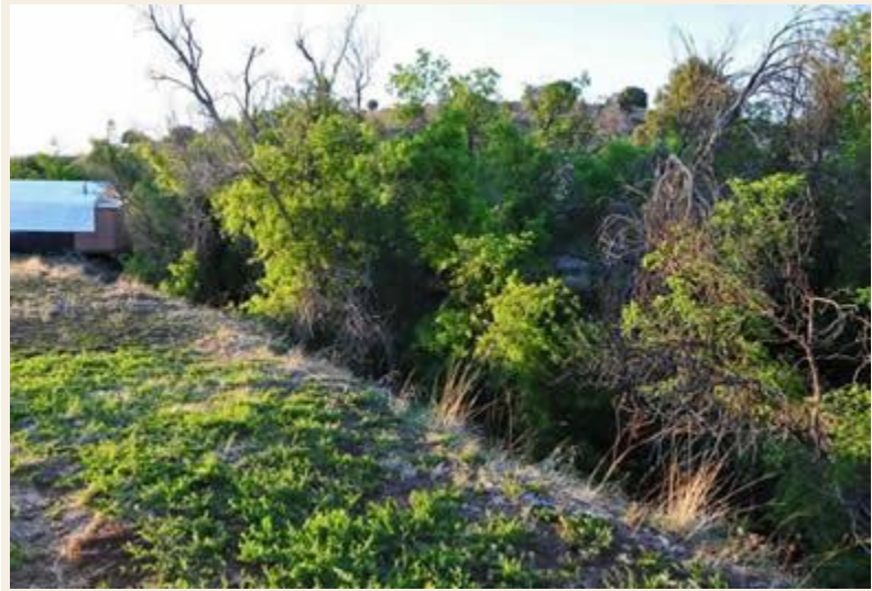
Riparian Vegetation at No Bar Ranch

All deciduous trees were fully leafed out and there was a scattering of wildflowers on the powdery dry ground. Temperatures ranged from highs in the mid-80s to a low of 40 degrees on Sunday morning. Winds were blustery (gusts of 25+ mph) out of the west on Friday afternoon but returned to normal light upslope breezes on Saturday. There was little to no cloud cover during our stay, but residual smoke from forest fires lingered most of the weekend.