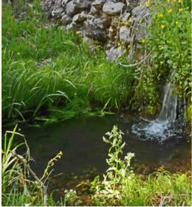
Stream in Smith Canyon