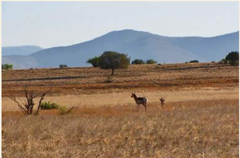
Upper Eagle Creek Uplands and Pronghorn

This area of Arizona is remote, but it is deserving of considerable additional study, at other seasons and with many additional skilled observers. There was considerable evidence of a rich wildlife environment in the vicinity of Upper Eagle Creek, including elk and pronghorn.