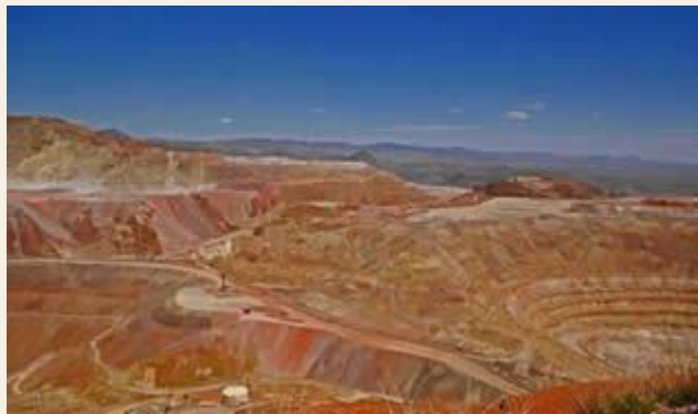
Morenci Copper Mine, looking southeast

(click here for the PDF version of the report)