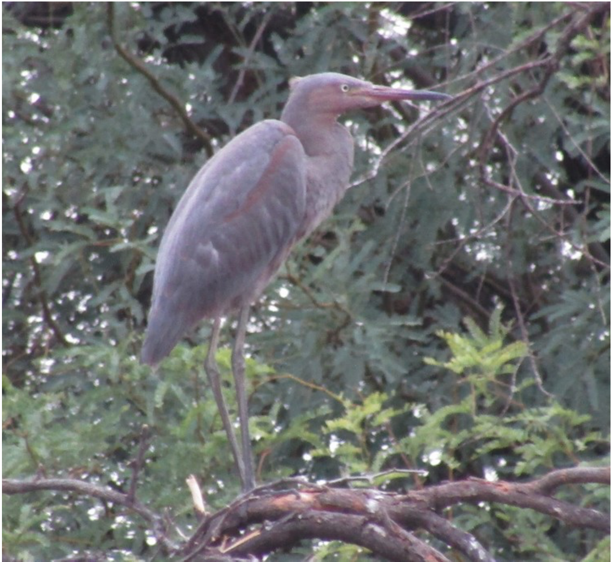
23 July 2020

A medium-sized heron. Juveniles/immatures have an overall odd, creamy dark gray coloration with patchy pale rusty tones to head, neck, breast and wings; dark legs and bill; contrasting pale eyes. The distinct pink base to the bill of this bird may indicate a second-year.