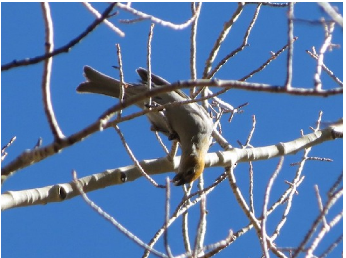
Pine Grosbeaks in the Tunitcha Mountains, Apache Co. (photos © Felipe Guerrero).