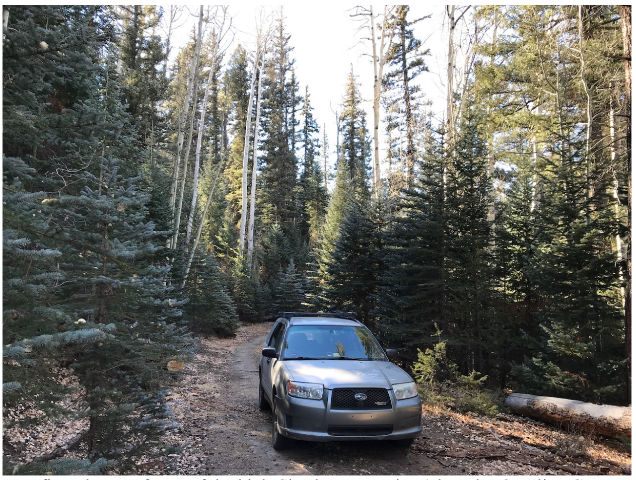
Spruce-fir and apsen forest of the high Chuska Mountains (photo by © Felipe Guerrero).

By Felipe Guerrero, edited by Eric Hough