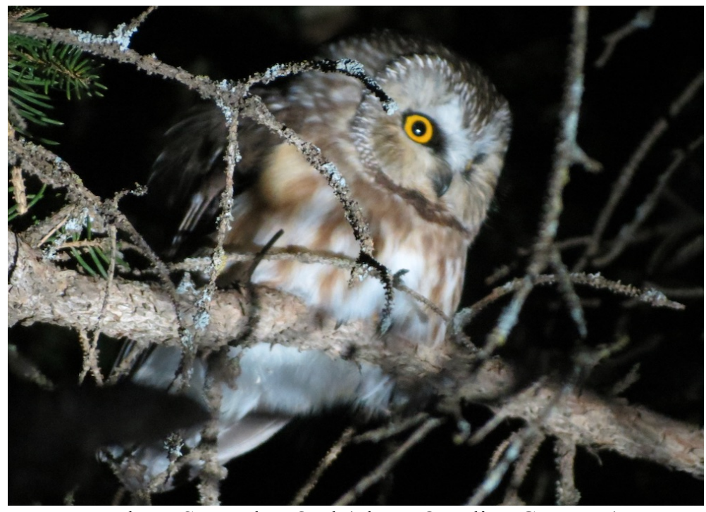
Northern Saw-whet Owl.

Other birds of note over the weekend were Northern Pygmy-Owl, Northern Saw-whet Owl, American Three-toed Woodpecker, and multiple Red Crossbill types.