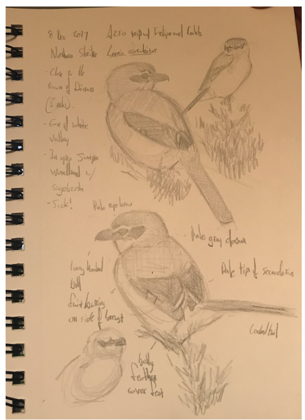
Field sketch of Northern Shrike by © Micah Riegner.

The following morning, we were thrilled to find a flock of 10 Pine Grosbeaks feeding on aspen buds and spruce seeds along upper Tsaile Creek in the Tunitcha Mountains, Apache County. The group of males and females foraged long enough for us to obtain photos and recordings. Pine Grosbeaks have only been known to breed in Arizona only in the White Mountains, but have also been found on the Kaibab Plateau and San Francisco Peaks where they may breed. Given the habitat present in the Chuskas, they may also be resident rather than a winter migrant.