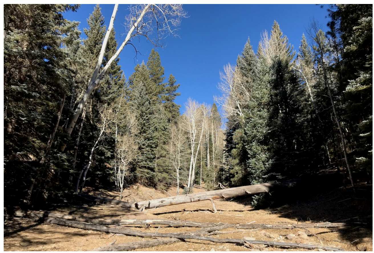
Spruce-fir-aspen forest habitat near Tsaile Creek.

On the afternoon of 10 December, after a second full day of surveying in the Tunitcha Mountains, a flock of Red Crossbills containing two White-winged Crossbills left us awestruck and euphoric in the final hour of our expedition. The birds were thoroughly documented with photos, recordings, and field sketches. This is only the second state record for White-winged Crossbill.