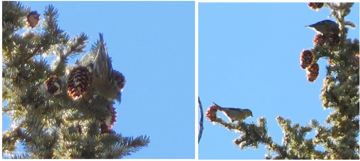
White-winged Crossbills.

On the afternoon of 10 December, after a second full day of surveying in the Tunitcha Mountains, a flock of Red Crossbills containing two White-winged Crossbills left us awestruck and euphoric in the final hour of our expedition. The birds were thoroughly documented with photos, recordings, and field sketches. This is only the second state record for White-winged Crossbill.