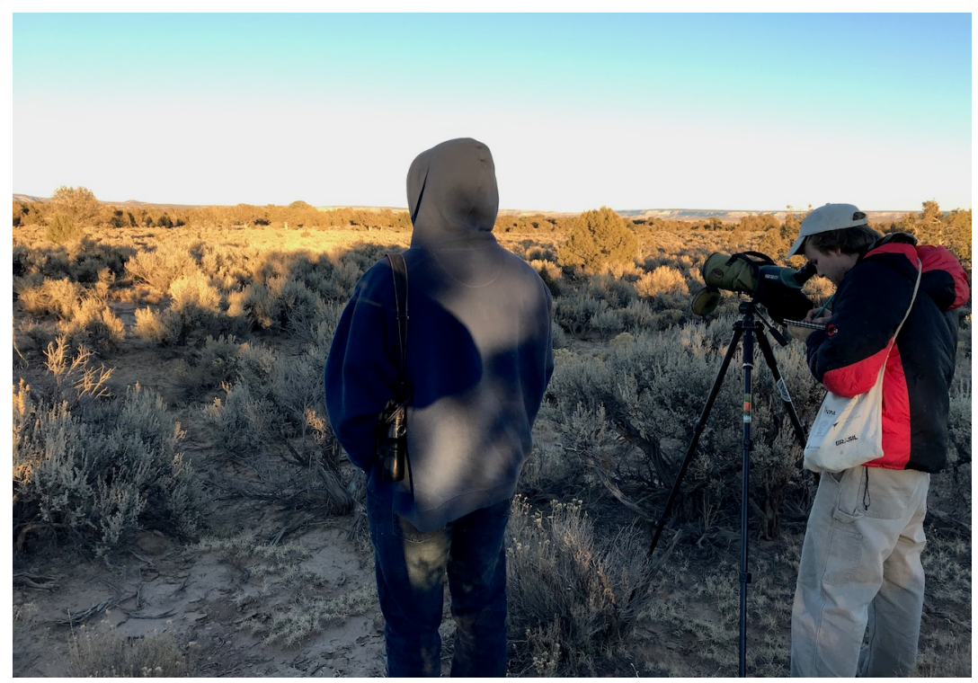
Rez birding near Piñon, Navajo Co. (photo © Felipe Guerrero).

On the evening of 8 December, while in transit to Chinle, we were fortunate to cross paths with a Northern Shrike west of Pinon, Navajo County. The adult bird tolerated close approach, perched atop junipers and sagebrush, allowing for photos and field sketches as sundown neared.