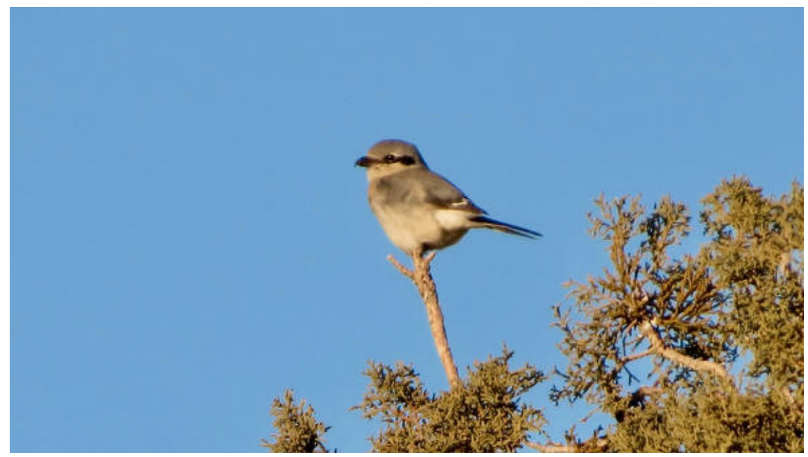
Northern Shrike near Piñon, Navajo Co. (photo © Felipe Guerrero).

On the evening of 8 December, while in transit to Chinle, we were fortunate to cross paths with a Northern Shrike west of Pinon, Navajo County. The adult bird tolerated close approach, perched atop junipers and sagebrush, allowing for photos and field sketches as sundown neared.