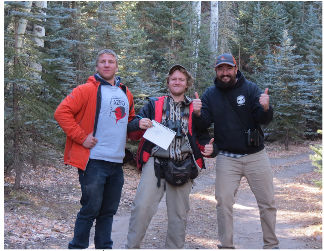
Celebrating a 2<sup>nd</sup> state record! (photos © Felipe Guerrero).

Other birds of note over the weekend were Northern Pygmy-Owl, Northern Saw-whet Owl, American Three-toed Woodpecker, and multiple Red Crossbill types.