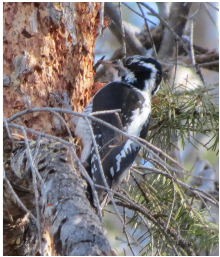
American Three-toed Woodpecker (photo © Felipe Guerrero).

A special thanks to our participants, Micah Riegner and Caleb Strand, for a particularly memorable expedition!