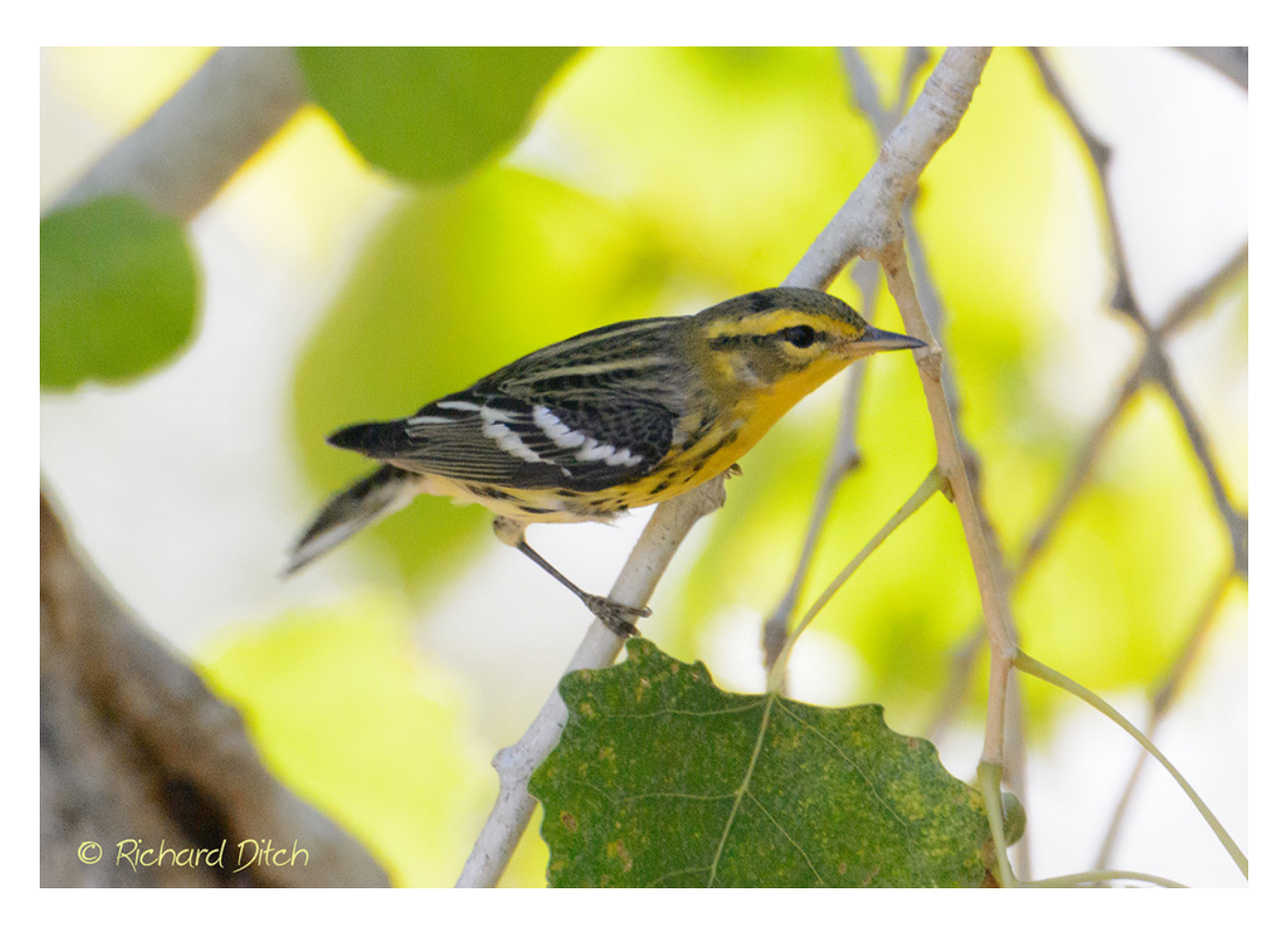
29\ September\ 2020,\ photo\ by\ Richard\ Ditch