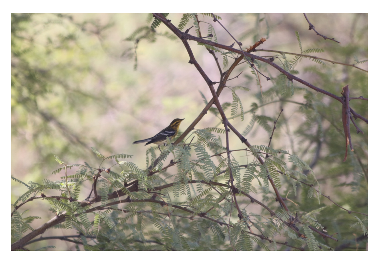
29 \ September \ 2020