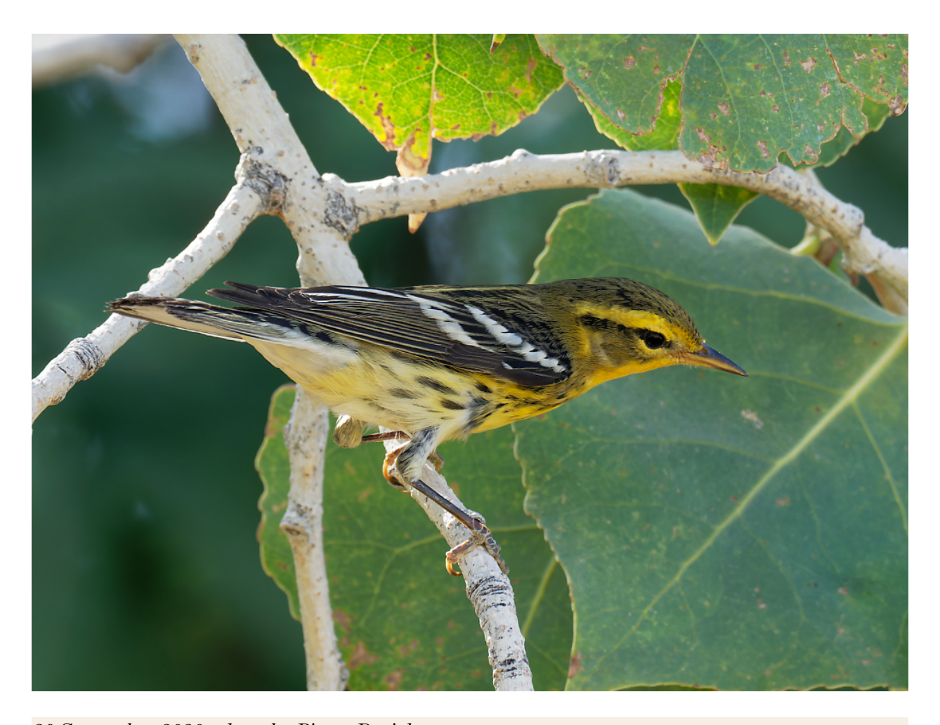
29 September 2020