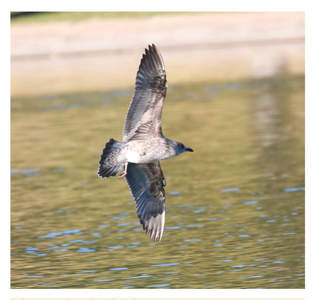
15\ October\ 2020,\, photo\ by\ David\ Stejskal

All photos are copyrighted© by photographer